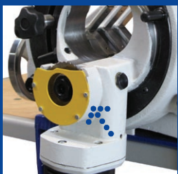
Second saw blade position to cut off elbows.