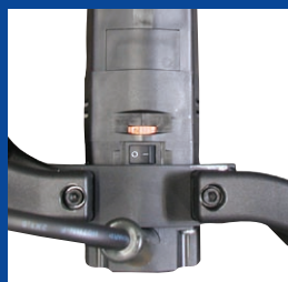
Powerful drive with overload protection and ergonomically designed motor handle.