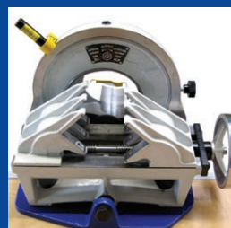
Hardened cast iron clamping jaws – stainless steel caps optional available.