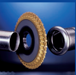
Square, burr-free and deformation-free pipe end – ideal for press fitting applications!