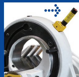
Integrated laser pointer to mark the cut off point.